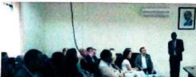
Director General /RCA explaining Rwandan cooperative movement to Swedish delegation member of parliaments with high officials.

Rwanda cooperative Agency welcomed a delegation of Swedish Parliamentarians and the visit was purposely to know more about Rwandan cooperative movement and understand its contribution to the socio-economic development. Best experiences for both sides were shared.